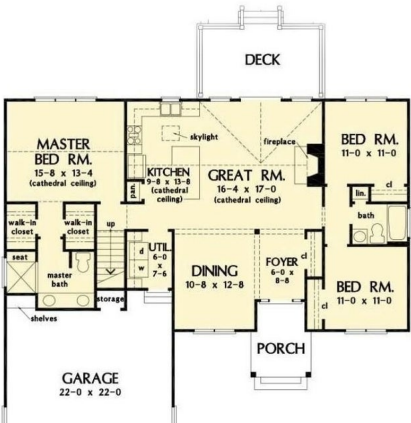
FLOOR PLAN PLAN NO. 1589